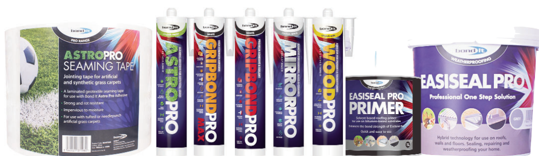
Part of the Bond It Pro Hybrid Sealants & Adhesive Range

The data presented in this leaflet are in accordance with the present state of our knowledge, but do not absolve the user from carefully checking all supplies immediately on receipt. We reserve the right to alter product constants within the scope of technical progress or new developments. The recommendations made in this leaflet should be checked by preliminary trials because of conditions during processing over which we have no control, especially where other companies raw materials are also being used. The recommendations do not absolve the user from the obligation of investigating the possibility of infringement of third parties rights and, if necessary clarifying the position. Recommendations for use do not constitute a warranty, either expressed or implied, of the fitness or suitability of the products for a particular purpose.