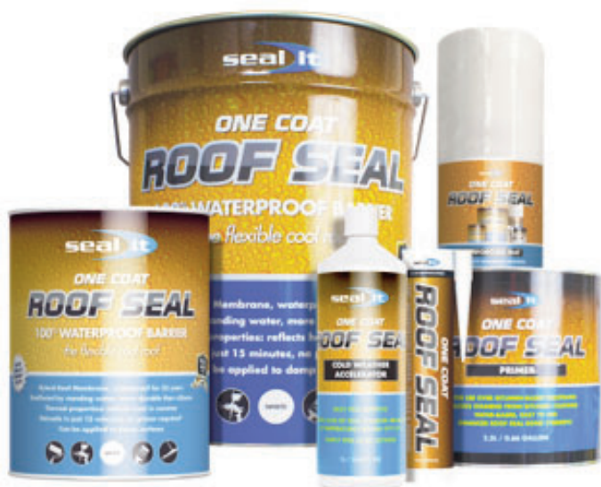
Part of the Seal It One Coat Roof Seal Range

The data presented in this leaflet are in accordance with the present state of our knowledge, but do not absolve the user from carefully checking all supplies immediately on receipt. We reserve the right to alter product constants within the scope of technical progress or new developments. The recommendations made in this leaflet should be checked by preliminary trials because of conditions during processing over which we have no control, especially where other companies raw materials are also being used. The recommendations do not absolve the user from the obligation of investigating the possibility of infringement of third parties rights and, if necessary clarifying the position. Recommendations for use do not constitute a warranty, either expressed or implied, of the fitness or suitability of the products for a particular purpose.