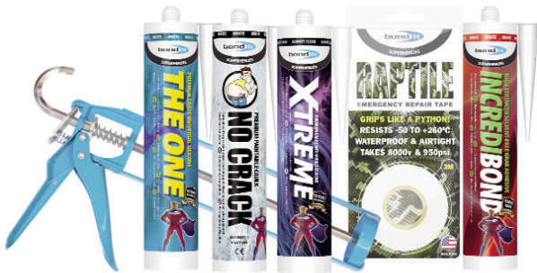
Part of the Bond It Superheroes Range

The data presented in this leaflet are in accordance with the present state of our knowledge, but do not absolve the user from carefully checking all supplies immediately on receipt. We reserve the right to alter product constants within the scope of technical progress or new developments. The recommendations made in this leaflet should be checked by preliminary trials because of conditions during processing over which we have no control, especially where other companies raw materials are also being used. The recommendations do not absolve the user from the obligation of investigating the possibility of infringement of third parties rights and, if necessary clarifying the position. Recommendations for use do not constitute a warranty, either expressed or implied, of the fitness or suitability of the products for a particular purpose.