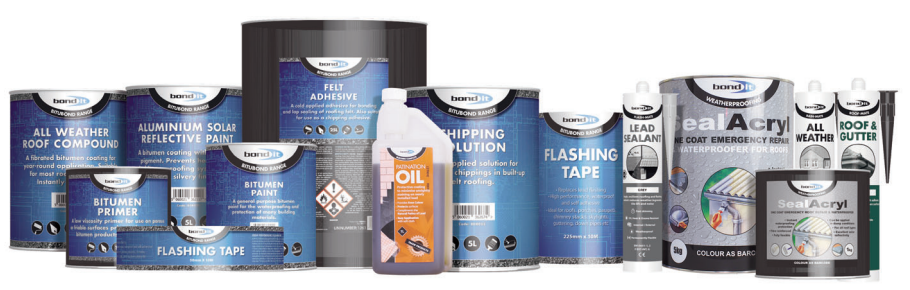
Part of the Bond It Roofing & Weatherproofing Range

The data presented in this leaflet are in accordance with the present state of our knowledge, but do not absolve the user from carefully checking all supplies immediately on receipt. We reserve the right to alter product constants within the scope of technical progress or new developments. The recommendations made in this leaflet should be checked by preliminary trials because of conditions during processing over which we have no control, especially where other companies raw materials are also being used. The recommendations do not absolve the user from the obligation of investigating the possibility of infringement of third parties rights and, if necessary clarifying the position. Recommendations for use do not constitute a warranty, either expressed or implied, of the fitness or suitability of the products for a particular purpose.